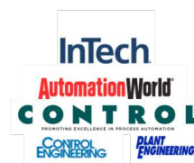
Appeared in over 50 Industry Publications