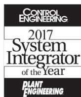
Named System Integrator of the Year